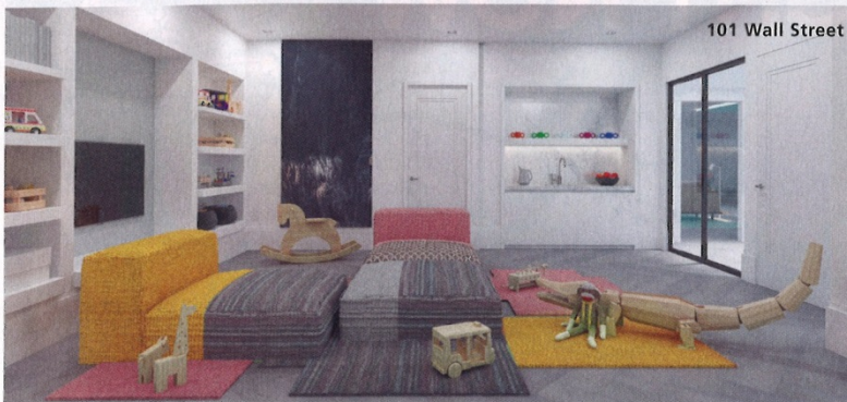
101 Wall Street