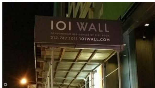
&183; 101 Wall [teaser site]

Signage just went up on the site, where not even a year ago , Claremont was taking advantage of a clause in its tenants' leases to boot them and make way for this conversion. It was all rumor then, but a major loan in September confirmed it.