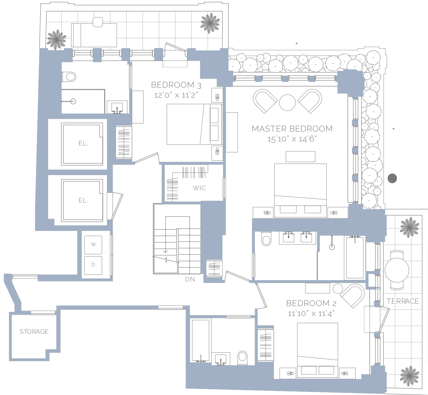
UPPER LEVEL | 1,401 SQ FT